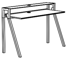
Trio desk 1270W x 500D x 730H Ref: OLTRDK