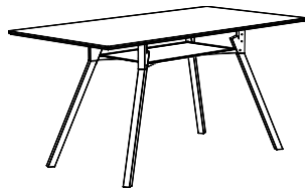
Trio meeting table 1500W x 900D x 740H Ref: OLTRDT